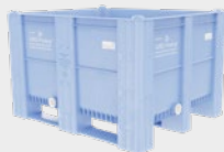
WBG-Pooling-BigBox 1000 drain 605L light blue