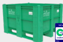
WBG-Pooling-BigBox 1000 green