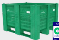
WBG-Pooling-BigBox 1000 perforated green