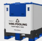
WBG-Pooling-Liquid-BigBox 1000 grey