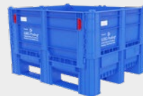
WBG-Pooling-BigBox 1000 foldable blue